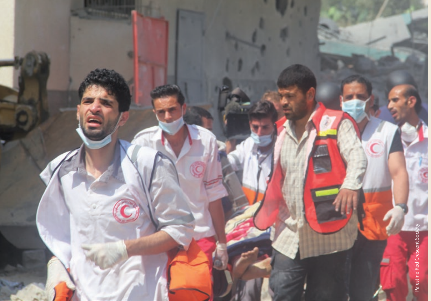
Palestine Red Crescent Society

hospital care, for example, they have forged partnerships with other health-care providers to better coordinate their services. And some National Societies have come together on a regional basis to develop procedures and best practice for ambulance staff and volunteers working in dangerous situations (see box p. 14).