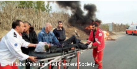
El Baba/Palestine Red Crescent Society